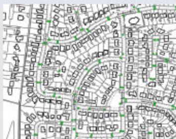
Map of gullies in Leeds