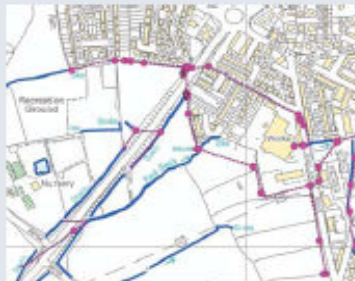
Map of culverts in Leeds

Leeds experienced serious flooding in 2005, with more minor flooding occurring during the summer of 2007. Leeds City Council put in place a Water Asset Management Working Group with an action plan and budget of approximately £1 million per annum. The majority of this budget has been spent on centralising the maintenance of Leeds City Council's watercourses through a process of identifying and recording their location and condition and thereby developing a maintenance regime accordingly.